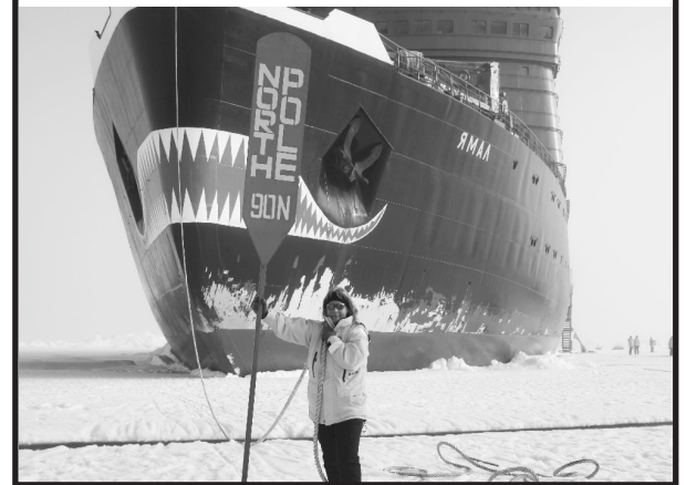
North Pole 2007 www.eaglecry.com/yamal.htm