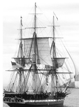
Built 1797 44 Gun Frigate - 3 masts 2200 tons displacement 204 ft length 43.5 beam 14.3 draft copper sheathing armor

Making Jamaica on 6 October, she took on 826 pounds of flour and 68,300 gallons of rum. Then she headed for the Azores, arriving 12 November. She provisioned with 550 pounds of beef and 64,300 gallons of Portuguese wine.