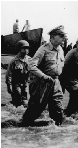
Lest we Forget... The three men who died as a result of the Kamikaze attack.